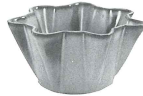
F33—3 3/4 x 7" FLUTED PLANTER 5.50