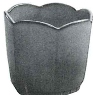
37—4" HEXAGONAL PLANTER 3.25