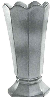
64—9 1/2" OCTAGONAL VASE 7.75