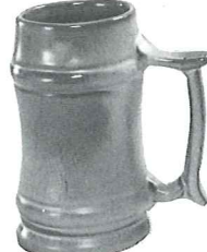
M2—6"—18 OZ. MUG 4.50