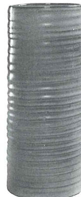
72—10" RINGED CYLINDER VASE 6.50