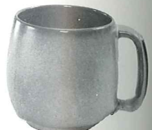
4M—4 1/2"—18 OZ. MUG 4.50