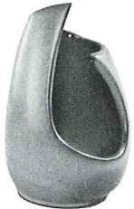
302—6" CANDLE VASE 4.75