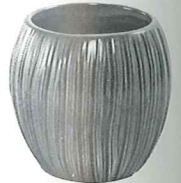
T7—3 1/2" COCONUT PLANTER 2.75