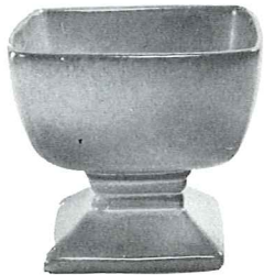
23A—6" SQ. PEDESTALLED VASE 6.50