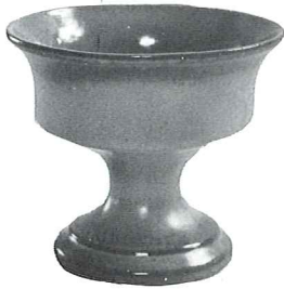
F52—7" PEDESTALLED URN 6.50