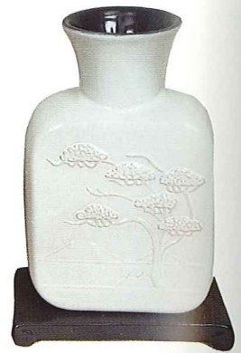
V-14—WHITE/NAVY BLUE 20.00