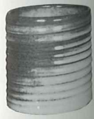
272—4" RINGED CYLINDER VASE 3.25