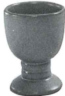
26LC—4 1/2"—6 OZ. TUMBLER VASE 3.25