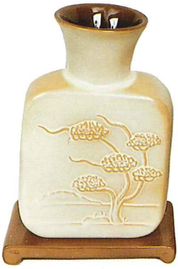
V-14—DESERT GOLD/COFFEE 20.00