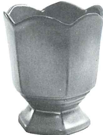
65—6 1/2" HEXAGONAL VASE 6.50