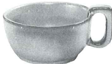
4SC—5" CUP-BOWL 3.75