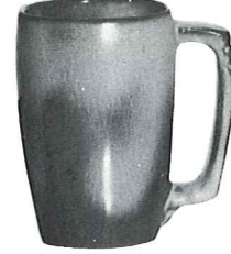
5M—5 1/2"—16 OZ. MUG 4.50