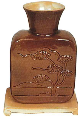
V-14—COFFEE/DESERT GOLD 20.00