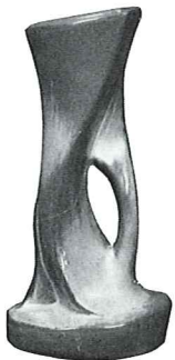
95—8 1/2" FREE FORM VASE 6.50