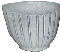
176—4" PLANTER 4.00